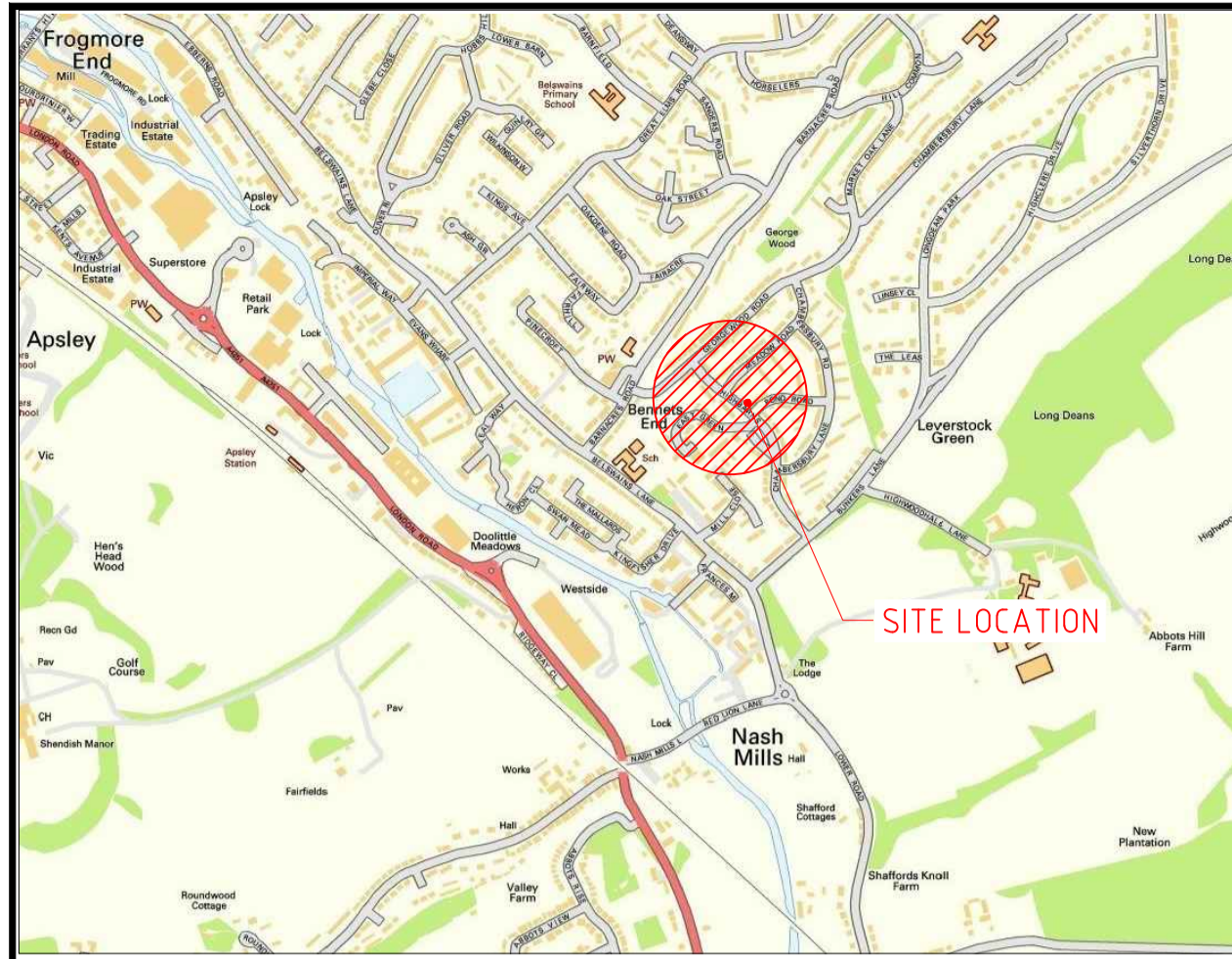
SITE MAP NTS