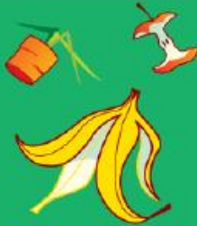
fruit & vegetables