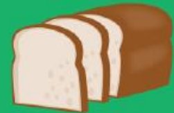
bread & pastries

Do not feed any liquids or packaging or your monster will get sick.