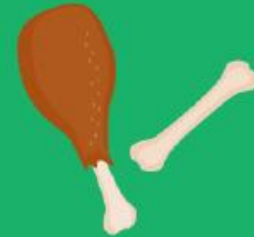
meat & bones