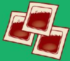
tea & coffee grounds